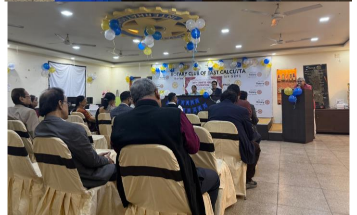
Glimpses of the 58th Charter Night Celebration